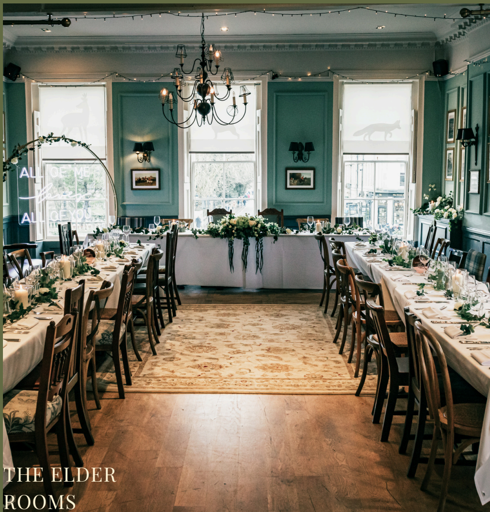
THE ELDER ROOMS